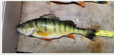
Jim Hough caught 12 7/8 perch in Wawasee on a minnow.