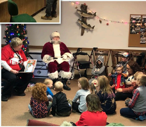
Santa's Elf reading to the children "The Night Before Christmas"